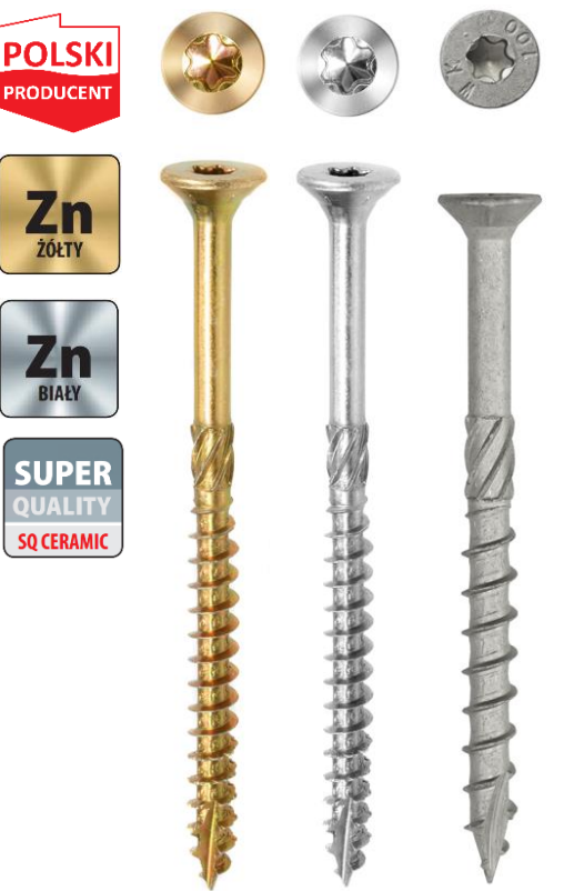
Zn - yellow Zn - blue* SQ ceramic* *Item on request and to order

Screws conform to European standard: PN-EN 14592:2008+A1:2012