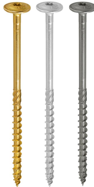
Zn - yellow Zn - blue* SQ ceramic* *item on request and to order